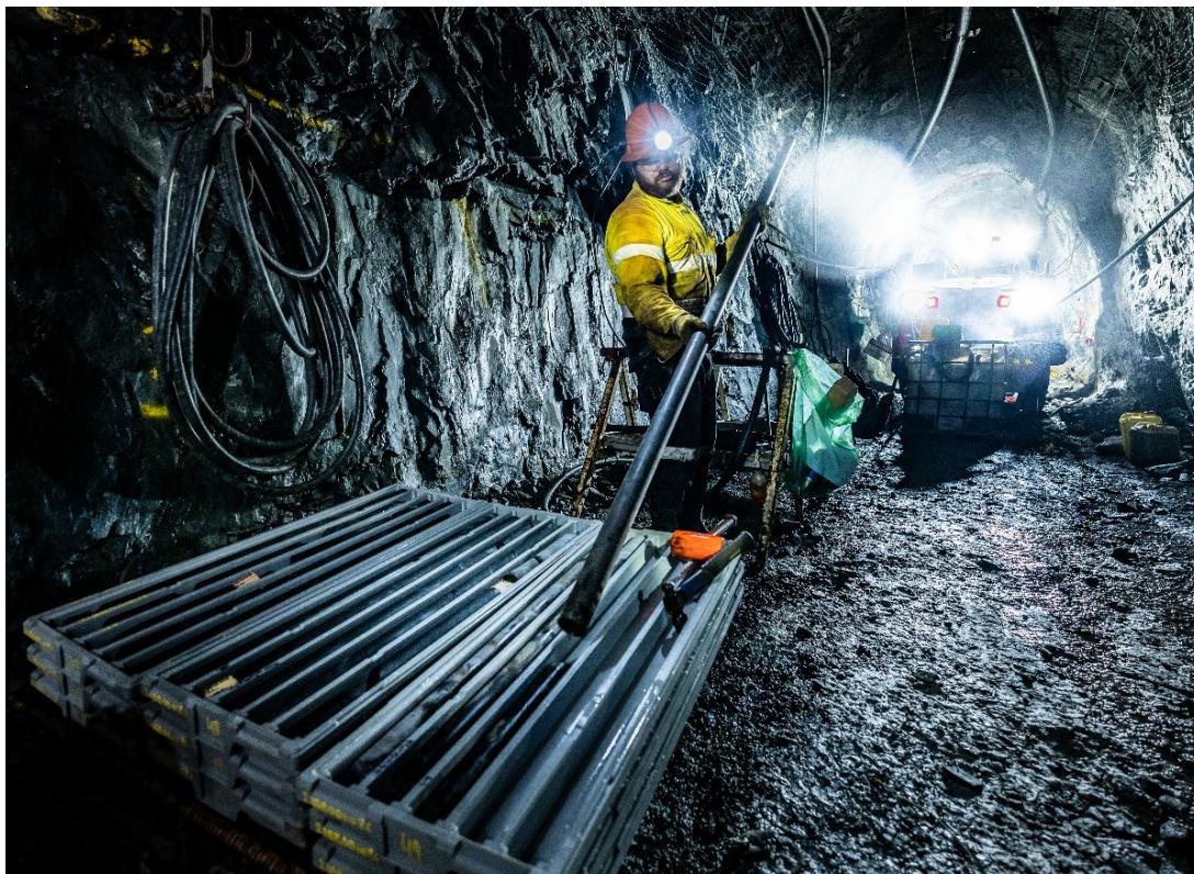
Underground Drilling Operations