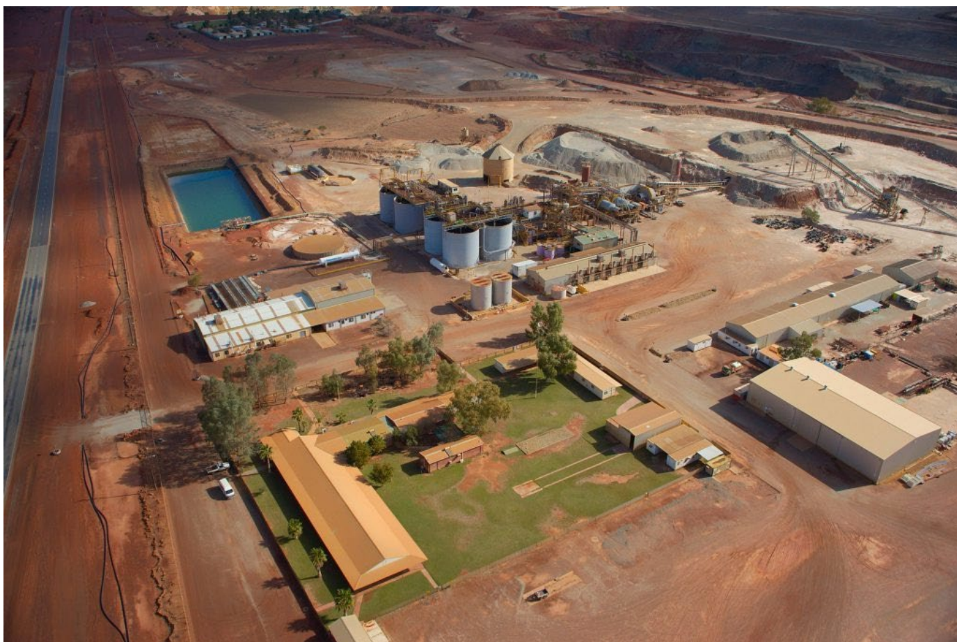
Figure 2. Westgold Bluebird Mill and Processing Facility

Bluebird has a milling capacity of circa 1.6 - 1.8Mtpa on hard ore and can process circa 2.2Mtpa on a blend of hard and soft ore.