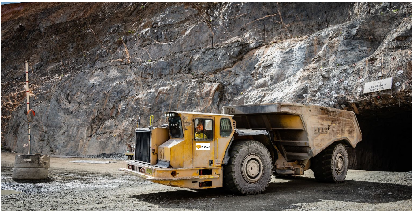
Plate 1 - Starlight Portal