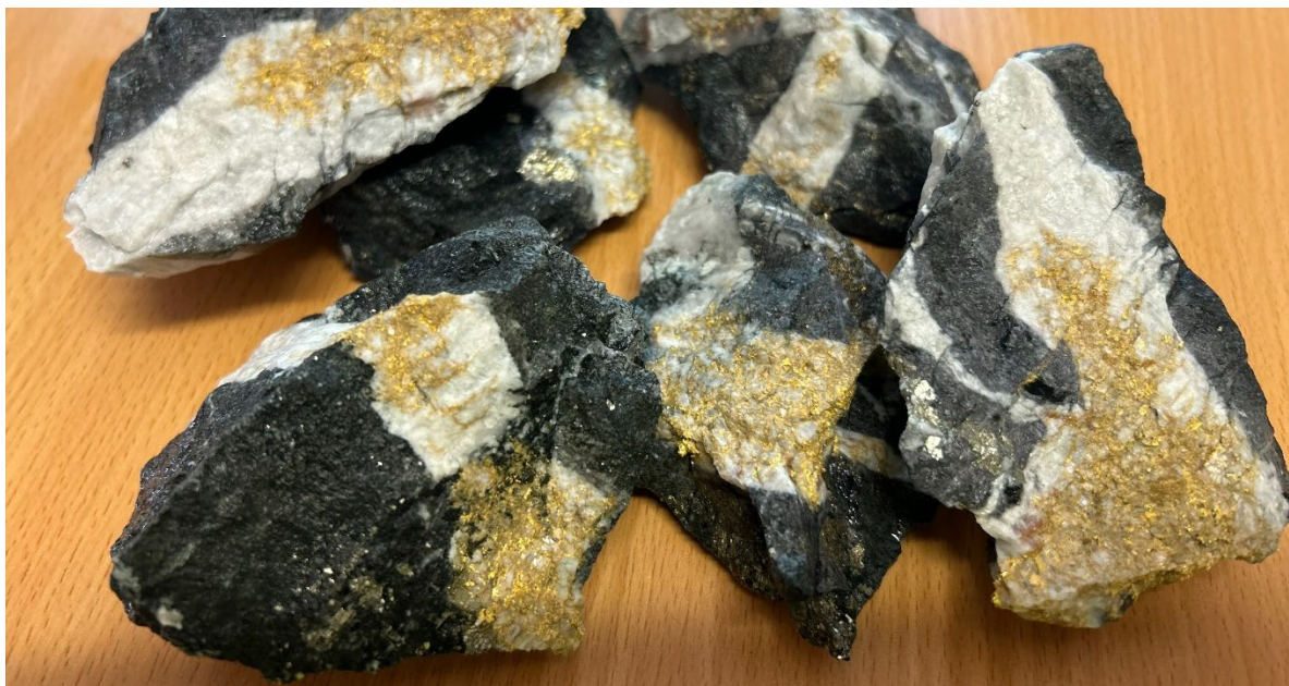
Figure 1 – Visible gold in quartz from the Bluebird mine

Our wholly Western Australian gold business will be enhanced when the merger with Karora completes, subject to conditions precedent, at the end of July. The expanded Westgold 3.0 will be a unique prospect in the Australian gold space – an unhedged, well-funded owner operator that is fully leveraged to the gold price. With an extensive pipeline of organic expansion, development and exploration opportunities, Westgold 3.0 will have unparalleled growth potential and offer an unrivalled value proposition to a much wider investment market.”