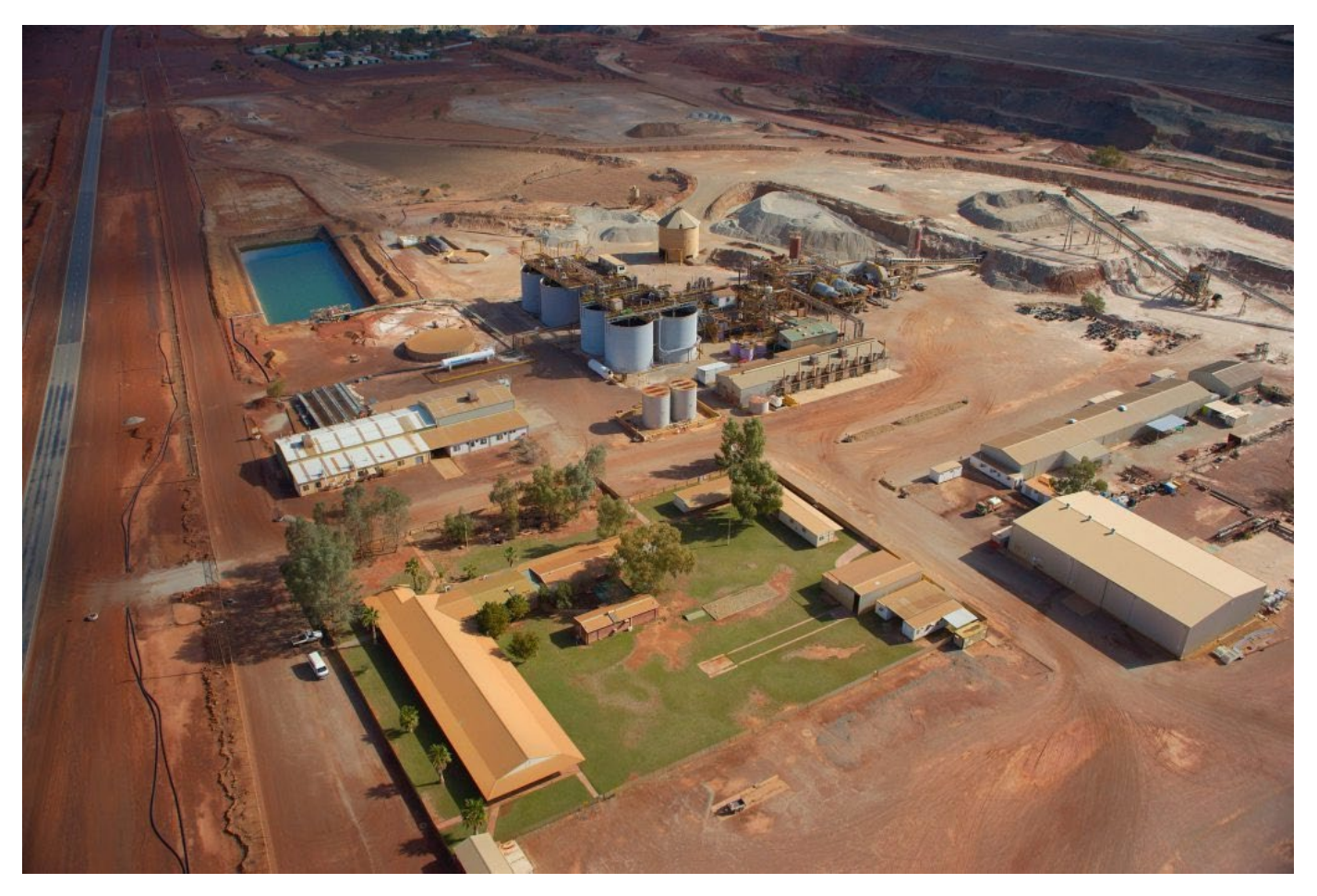
Figure 2. Westgold Bluebird Mill and Processing Facility

Bluebird has a milling capacity of circa 1.6 - 1.8Mtpa on hard ore and can process circa 2.2Mtpa on a blend of hard and soft ore.